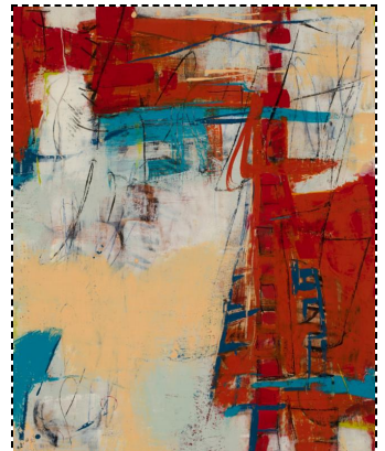
Artist Talk: Sunday, February 8, 3:00pm First Friday Art Walks: February 6 and March 6, 5:00-8:00pm